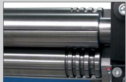
Folding groove and Wiring channels