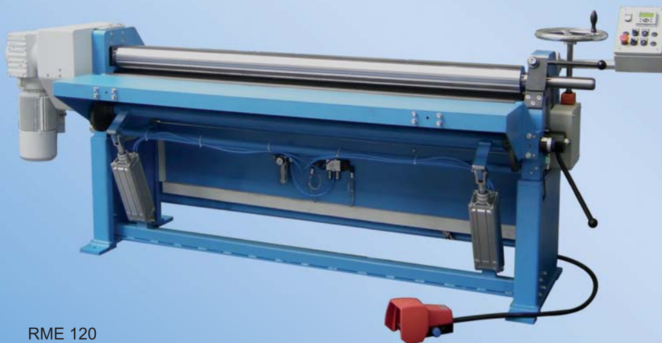
RME 120 With pneumatically operated pre bending device

For professional rounding of sheet metal!