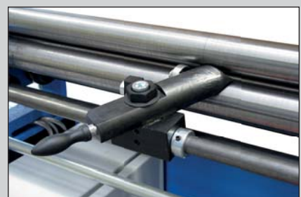
Side stop for conical rounding