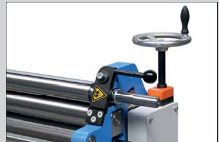
Adjustment of the rear roll