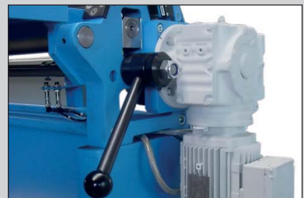
Motorized infeed of the back roll