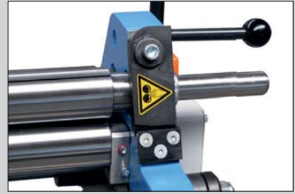
Lock bearing of upper roll